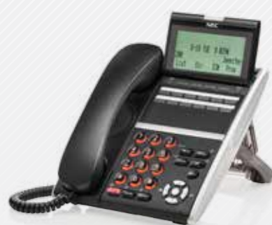
DT430 & DT830