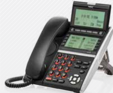
DT430 & DT830 Dual Display (Desi-less)