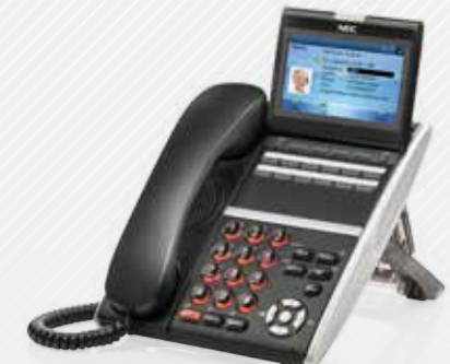
DT830CG Color Display