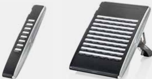
8-line Key Module